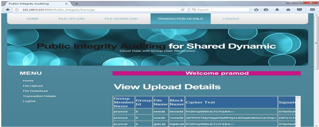
Fig8. Transaction Details

Website: <u>www.ijirset.com</u> Vol. 6, Issue 5, May 2017