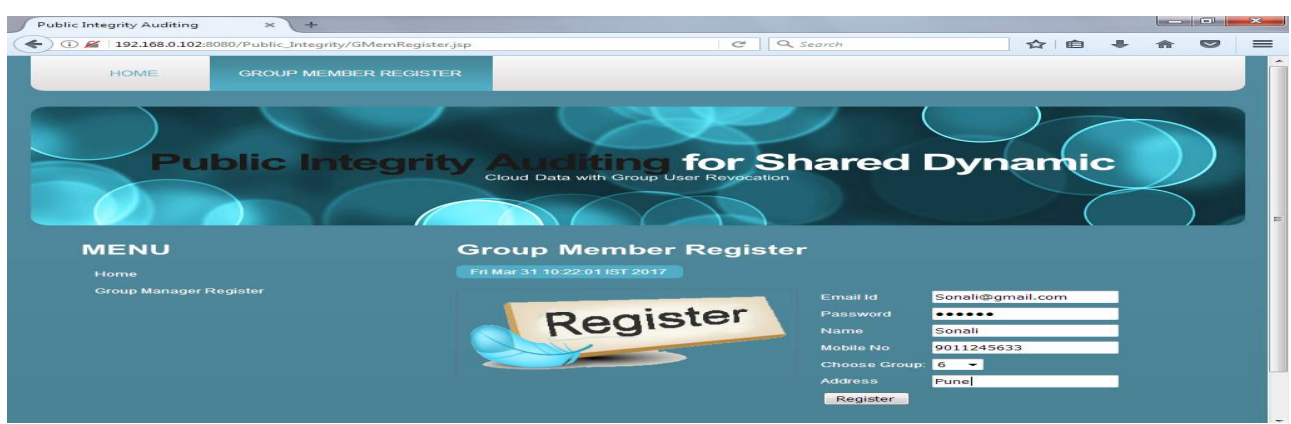
Fig2. User Registration

To register user needs enter email, password, name, mobile number, select group and address. All details are valid. Details are wrong registration is fail.