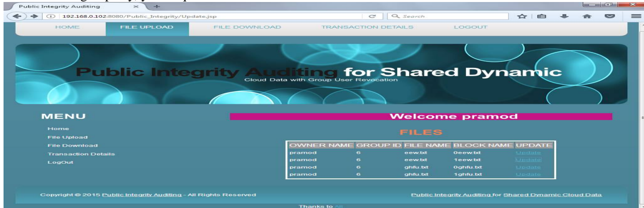
Fig7. File Update

You can enter group key, your require file name enter and download file.