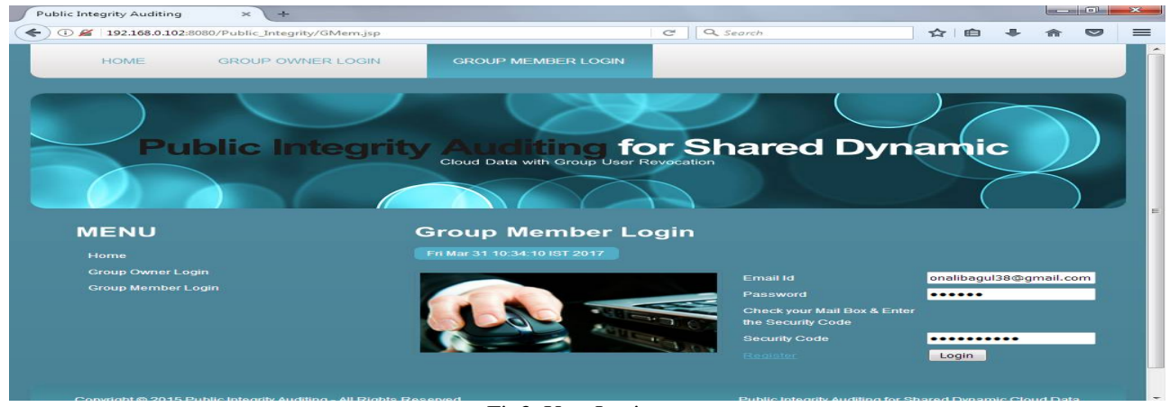
Fig3. User Login

To register user needs enter email, password, name, mobile number, select group and address. All details are valid. Details are wrong registration is fail.