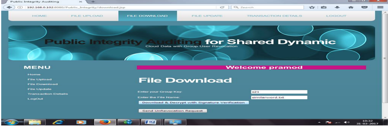
Fig6. File Download

You can select text file other file cannot accept here.