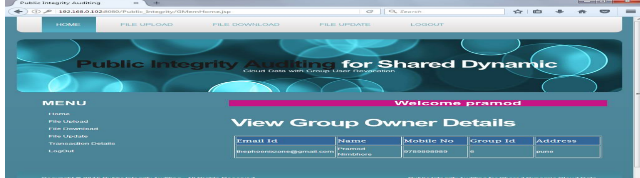
Fig4. User Home Page

User login time user enter email and password, system send security code you enter email. Public Integrity Auditing Public Integrity Auditing Public Integrity Auditing Public Integrity/GMemHomejsp