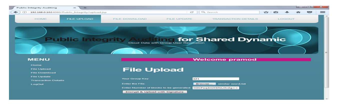
Fig5. File upload

Website: <u>www.ijirset.com</u> Vol. 6, Issue 5, May 2017