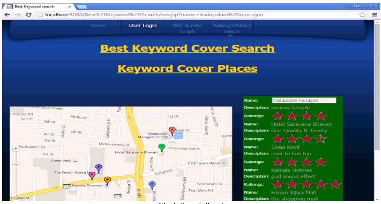
Fig 4. Search Result