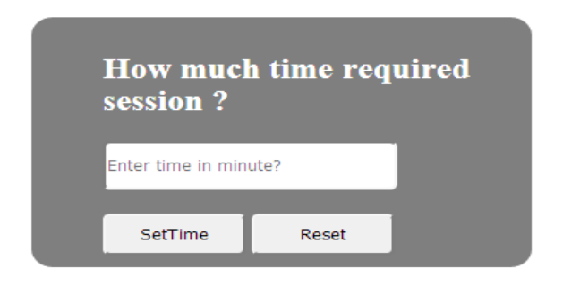
Figure 1.how much time require for session start

Website: <u>www.ijirset.com</u> Vol. 6, Issue 5, May 2017