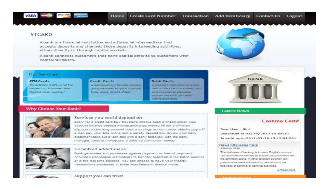
Figure 2. Home Page

When the user login, System ask user how much time require for session start? The user can input time in minute.