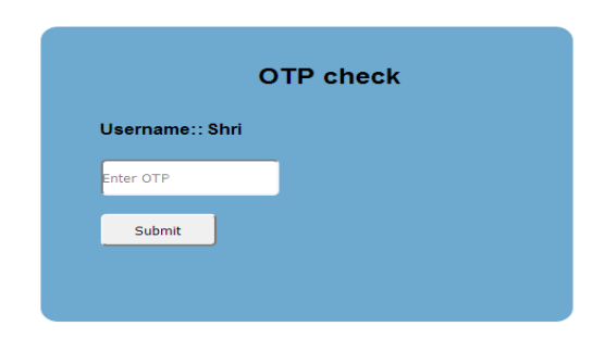
Figure 3. Ask OTP