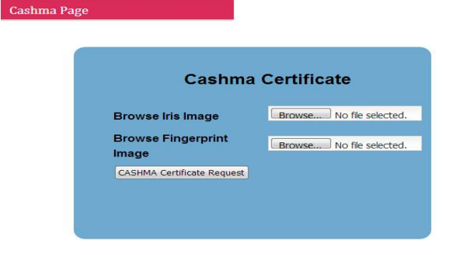
Figure 4. Ask finger print image

If system stay idle for one minute then it raises user validation is user authorised or not. If user fails to answer the security parameter, then system will take out of the system to the user.