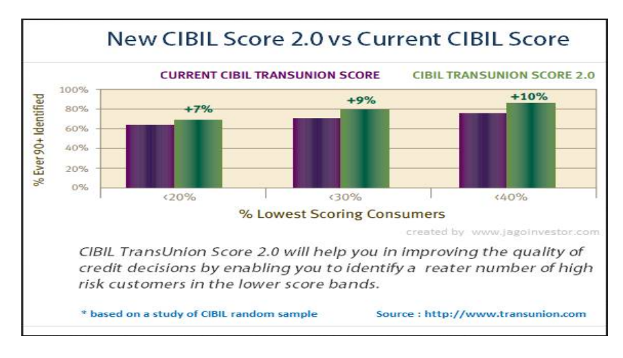
Fig 7.2:CIBIL verification improvement ratio

The customer will be able to login into the system after self registration. once the registration is successful the customer can apply for loan online via the system. This reduces the hassle for the customers. Once after the submission of loan details is successful, It will be processed further by verifying the details through CIBIL scores and PAN details by the bank employee. After all details being verified and found valid the loan will be approved by bank employee else the loan will be rejected.finally the status of the loan can be checked by the customer by logging into the website with valid user credentials.