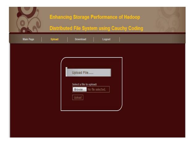
Fig. 5. Upload File