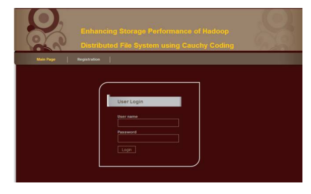
Fig. 1. User Login