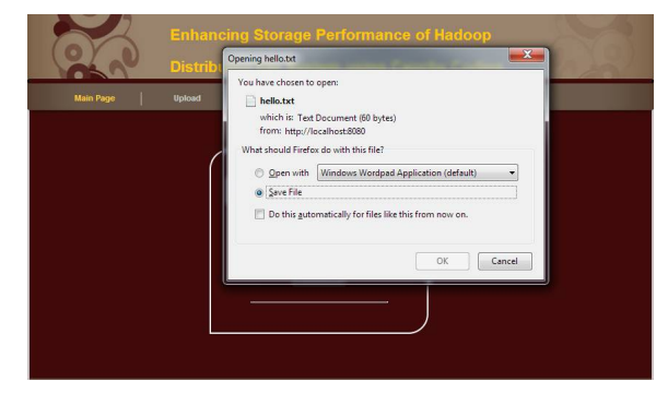
Fig. 7. Save File

(An ISO 3297: 2007 Certified Organization) Website: <u>www.ijirset.com</u> Vol. 6, Issue 5, May 2017