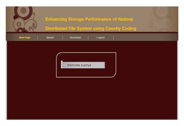
Fig. 4. Main Page

(An ISO 3297: 2007 Certified Organization) Website: <u>www.ijirset.com</u> Vol. 6, Issue 5, May 2017