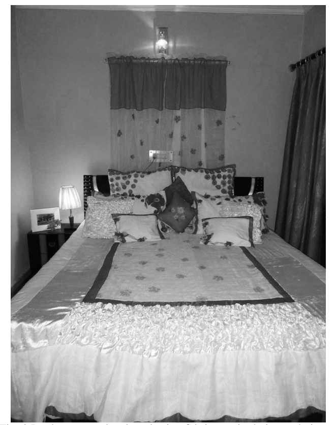
Fig. 2 Product range developed using fabric manipulation techniques

After sketching of various layouts, the researcher constructed the products according to the theme. Mainly, glass tissue and chenille fabrics were chosen for the fabric manipulation techniques. Poplin was used for the base and back of the product.