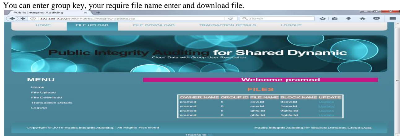
Fig7. File Update