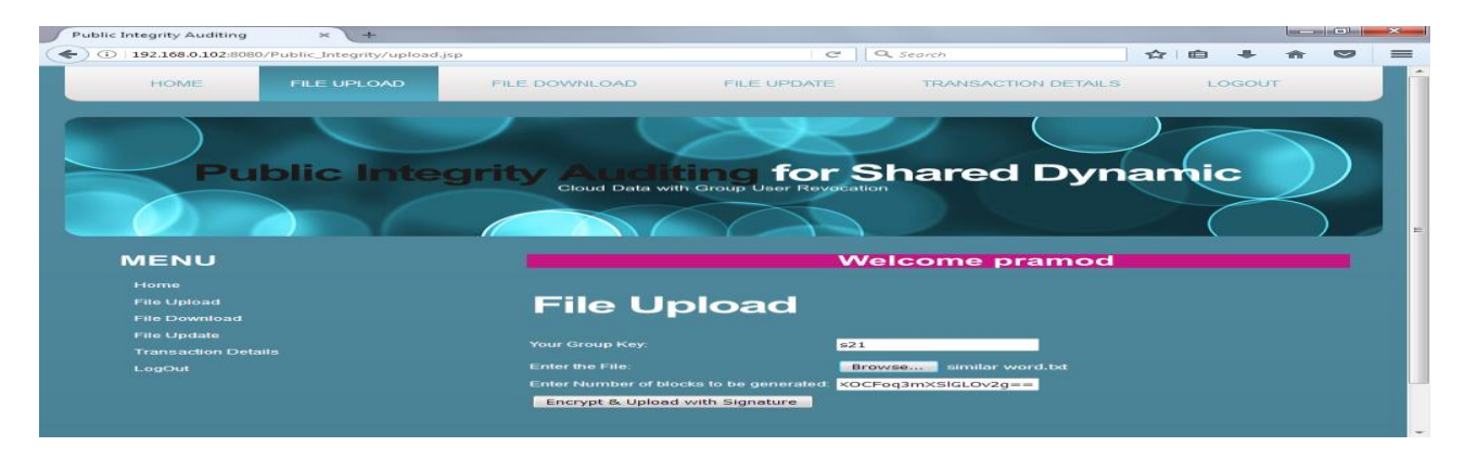
Fig5. File upload