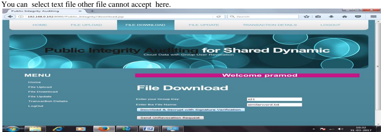
Fig6. File Download