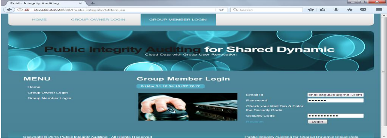
Fig3. User Login

To register user needs enter email, password, name, mobile number, select group and address. All details are valid. Details are wrong registration is fail.