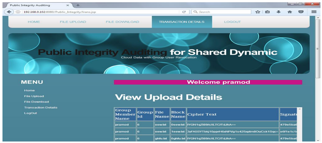
Fig8. Transaction Details

The following analysis graph shows that to encrypt and partition of our file data not vary to much with file. To complete this analysis we perform execution on different files of different size. In this first size is of very small size till it taking same time as the file of size 1500 byte is taking. This time taken is for the operations such as key generation, file encryption, file partition and file upload on cloud.