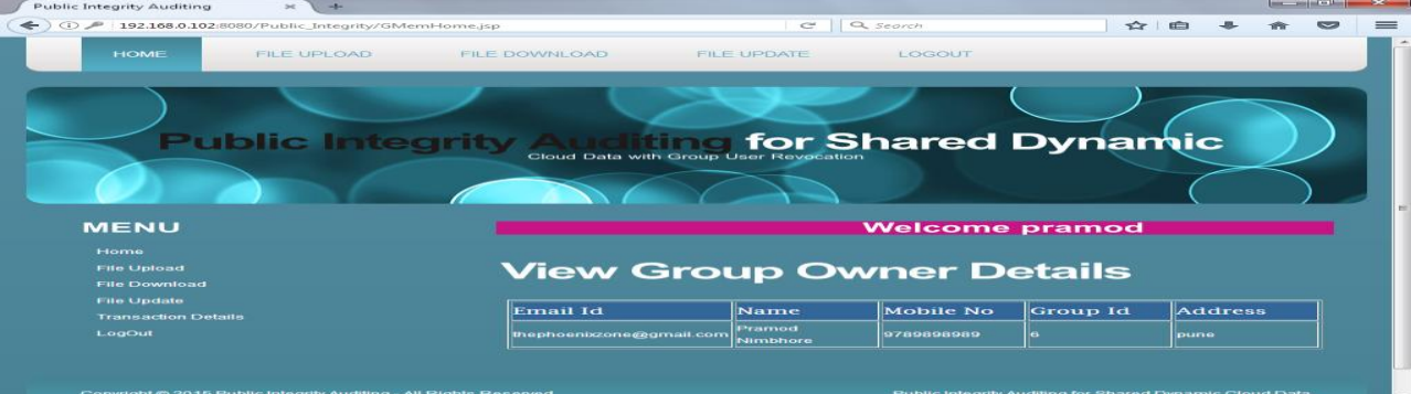
Fig4. User Home Page

User login time user enter email and password, system send security code you enter email.