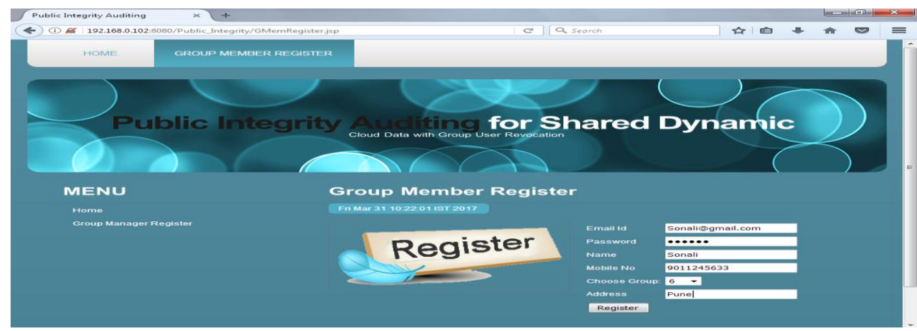
Fig2. User Registration

To register user needs enter email, password, name, mobile number, select group and address. All details are valid. Details are wrong registration is fail.