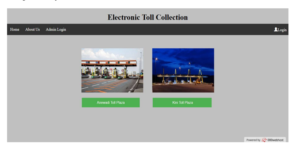
Fig.6.Toll plaza selection

The user can access his account from any location and can carry out the transaction using the web page. User interface for this purpose is shown in the Fig.6. Firstly, User can choose the toll plaza which he is going to visit as toll charges vary according to the toll plaza.