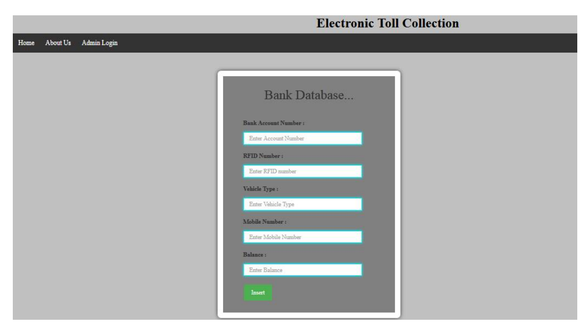
Fig.5.Add User Account

Once after the admin login, admin have authority to add the new user to the system and can also recharge the user's account to perform the transactions. User account details are provided in the Fig.5.