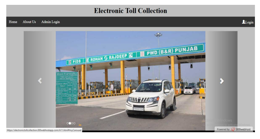
Fig.3.User Web Interface

First user interface of the webpage is shown in the Fig.3.User can also visit the about us session for details about the system.