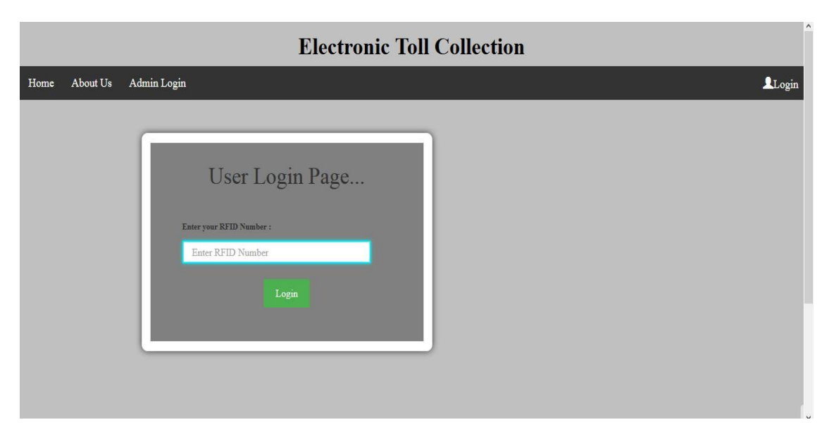
Fig.7.User login for transaction

Once After selecting the toll plaza, one can enter his/her RFID number to perform the transaction. User interface for this purpose is shown in the Fig.7.