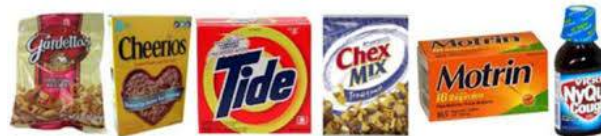
Fig. 1. Examples of printed text from hand-held objects with multiple colors, complex backgrounds, or non-flat surfaces.

However, these systems are generally designed for and perform best with document images with simple backgrounds, standard fonts, a small range of font sizes, and well-organized characters rather than commercial product boxes with multiple decorative patterns. Most state-of-the-art OCR software cannot directly handle scene images with complex backgrounds. A number of portable reading assistants have been designed specifically for the visually impaired .