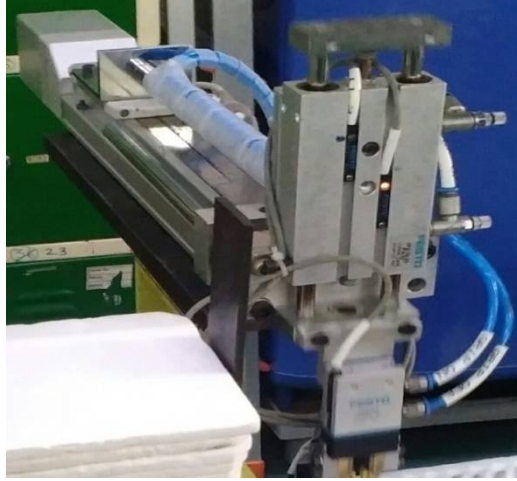
Figure 2 Linear Actuator