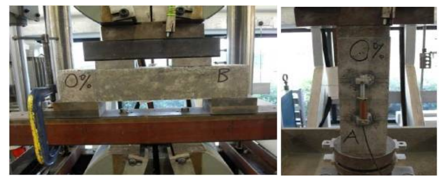
Fig: Instrumentation of beam specimen for direct shear test and Load vs. deformation test set up