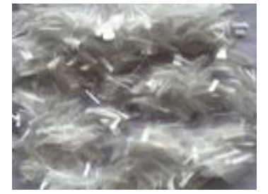
Fig.2 Polypropylene fibres