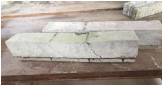
Fig. 10 Crack developed on beam retrofitted with SIFCON Laminate