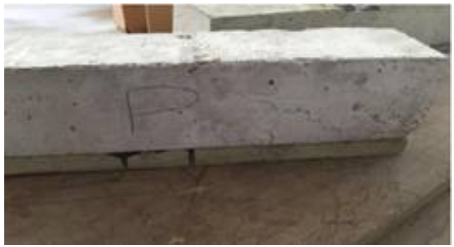
Fig.11 Crack developed on beam retrofitted with Polypropylene Laminate