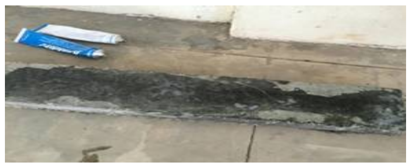
Fig.8 Araldite applied at the bottom face of distressed beam

After 28 days of curing all the laminates were bonded to the tension face of distressed beams using Araldite, a strong bonding agent. A bond line of 2.0mm thickness was kept constant for all specimens. After bonding leave the beams undisturbed for 7-14 days to ensure maximum bonding.