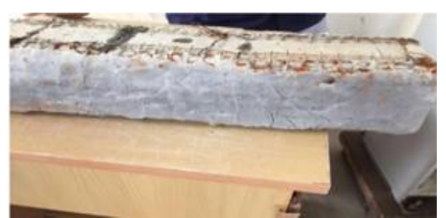
Fig. 9 Crack developed on Ferrocement after testing

The retrofitted beams were tested with the same procedure as adopted during the testing of control beams to calculate the ultimate load and the corresponding flexural strength. Fig (9), (10), (11) and (12) shows the crack developed on beams retrofitted with ferro cement, SIFCON, polypropylene and HFRC respectively after testing.