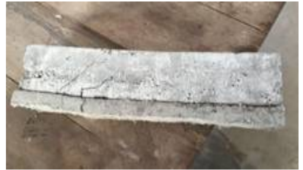
Fig .12 Crack developed on beam retrofitted with HFRC Laminate