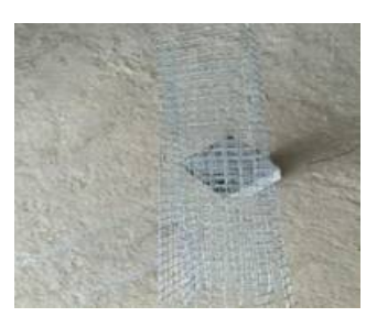
Fig.3 Square mesh

Square meshes of opening 16mm x 16 mm was used in ferro cement for retrofitting the RC beam as shown in Fig 3. Each wire of the mesh has 0.8 mm diameter.