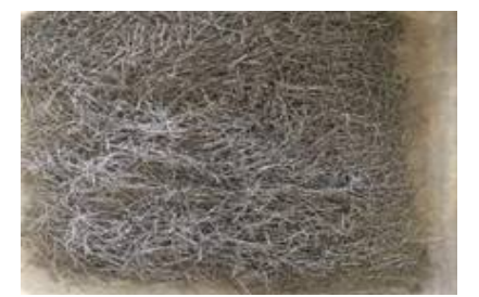
Fig.1 Crimped steel fibres

Polypropylene fibres are readily available in the market in the standard dimensions. Fiber of length 12mm with specific gravity 0.92 and density 930 kg/m<sup>3</sup> was used. The fibres used for the study is shown in Fig 2.