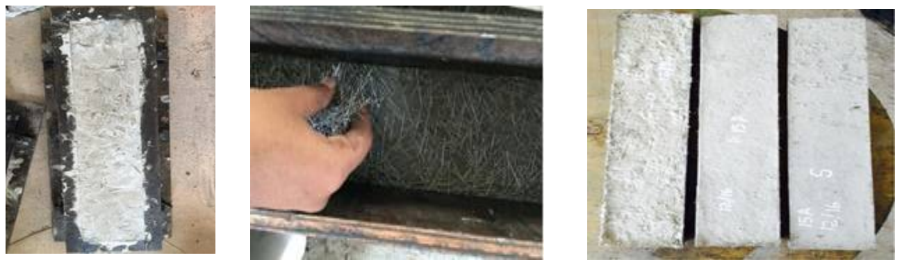
Fig .4 Casted Beams

Polypropylene and HFRC laminates of size 50cmx10cmx2cm was also casted in the same way as SIFCON laminates. Polypropylene fibres were used instead of steel fibres in polypropylene laminates. In HFRC laminates both steel fibres and polypropylene fibres were mixed simultaneously in equal proportion. Finished laminates were kept for 28 days curing.