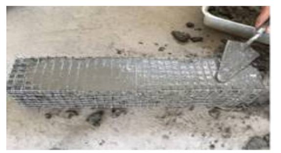
Fig .7 Applying mortar over wire mesh