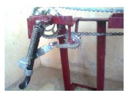
Fig:5 Resting condition

When two-wheeler is started Engine's pinion transmits power to the rear wheel by the chain drive. The inciter assembly which is kept at the centre of the chain drive gets rotates as the sprocket gets engage with chain drive. So, when the sprocket rotates the lifting lever mounted with axle rotates. Hence the lifting lever lifts engaged the pushing lever and therefore the pushing lever pushes the side stand by clamping it with the C shaped clamp stand holder and hence the spring tensed in the side stand get com-pressed quickly as a result side stand get retrieves.