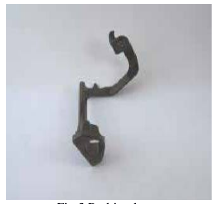
Fig:3 Pushing lever

Pushing lever is the component pivoted centrally to the side stand. The pushing lever is metallic c-shape rectangular plate, and top end is welded with a small piece of rectangular rod. Lifting lever lifts the pushing lever which lifts the side stand. Since this rod engages over tapered edge of lifting lever, thus the lifting occurs smoothly. The pushing lever is made of MS-flat rod with the length according to the distance of side stand arrangement. Its top end is extended perpendicularly so as to engage with lifting lever. The bottom end of the lever is made as C-clamp, which keep attached to the side stand.