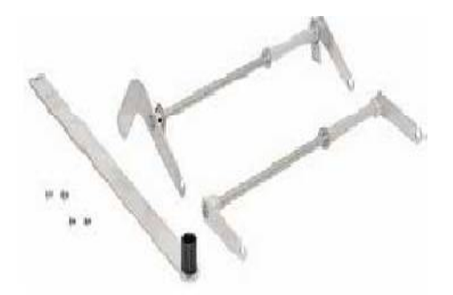
Fig:4 Lifting lever

Lifting lever is the major component of the system .The lifting lever is the rectangular rod made of ms-rod, which consists of two lifting leaves which is mounted with the edge of axle. The lifting leaves should be parallel to the sprocket pinion. The lifting lever is composed of two metal rods, where both are welded at either sides of the axle. The free ends of the lifting leaves are tapered well. The ends are machined well for tapered shape for smooth engaging with pushing lever.