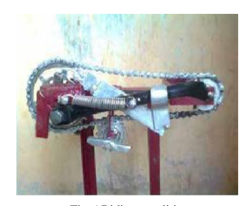
Fig:6 Riding condition