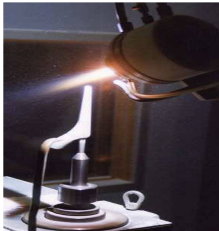
Fig. 1 plasma spraying of HA

Plasma spraying is the most widely applied method to deposit HA coating onto Ti implants. This method consists of injection of HA particles into a high temperature (>10000 K) plasma jet generated by a plasma torch, at atmospheric pressure (Atmospheric plasma spraying, APS), under vacuum (Vacuum plasma spraying, VPS) or under reduced pressure (Low pressure plasma spraying, LPS) [11, 12]. Intensive heating of HA particles may lead to dehydration and decomposition of HA and fast cooling of crystal phases in a solid core at impact results in conservation of high temperature phases.