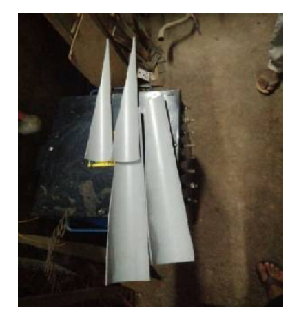
Fig 2: After Cutting PVC Pipes