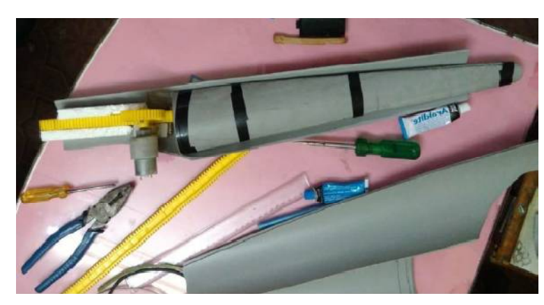
Fig 3: Blades after Fixing Mechanism