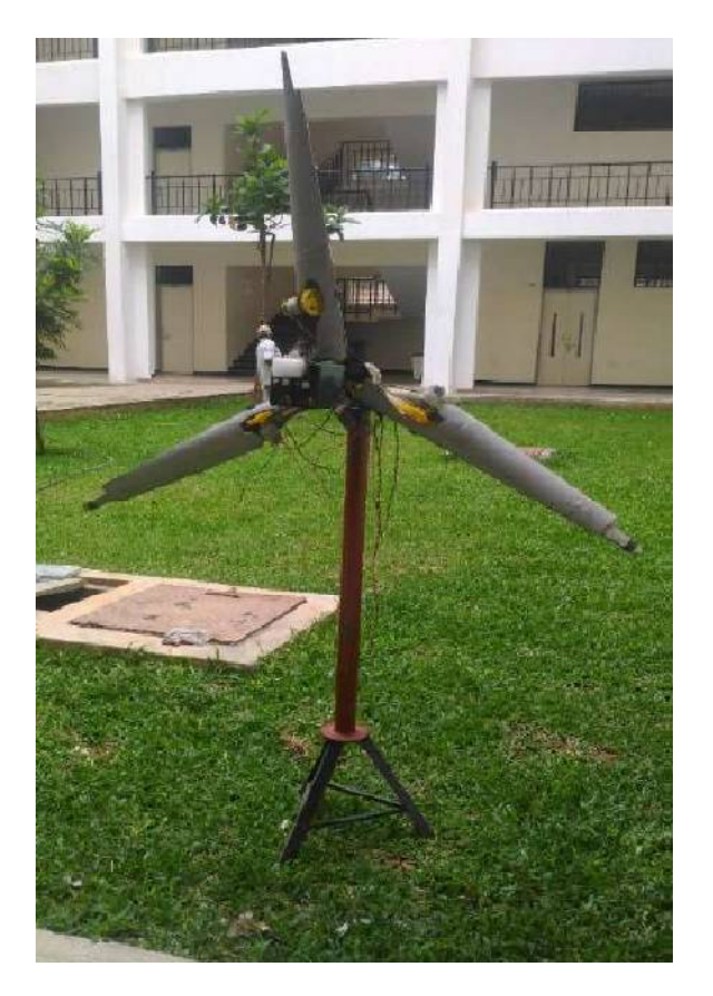
Fig 4: Working Prototype

Visit: www.ijirset.com Vol. 6, Issue 11, November 2017