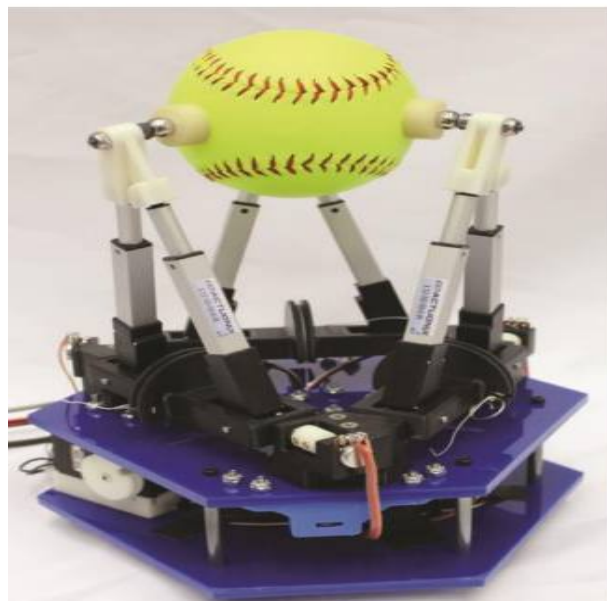
Fig.3. Dexterous Hand 6-DOF Within-Hand Manipulator [6]

The mechanism proposed by Connor M. McCann and Aaron M. Dollar [6] which is based on 'hexapod' structure of spatial parallel manipulator. The design consists of 1 'grasp' actuator which is controlled through an underactuated differential mechanism which controls 6 paired prismatic actuators. The 'grasp' actuator is designed by converting Stewart platform parallel manipulator by exchanging the spherical joint connection to end actuators with fingerpad mounted spherical joint. The object grasped acts as parallel manipulator and torque is applied inwards to exert a normal force at each of the contact prismatic actuators.