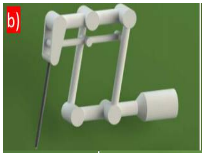
Fig.2. Surgical Telemanipulator model design in Solidworks [5]

Surgical telemanipulators are developed with a motive to increase precision, eliminate human error and hygienic conditions both for surgeon and patient. Laparoscopic procedures require extreme accuracy, along with the challenges being lack of space and low range of vision. These high precision procedures require a remote centre of motion (RCM), which allows the instrument to have a rotational motion about a point inside patient's body.