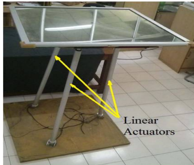
Fig. 1 Prototype of 3-RPS Heliostat [4]

The parallel manipulator consists of a linear actuator, DC motor, gear box and lead screw for each of the 3 legs. A proportional integral plus derivative (PID) control is established on a ATMEGA2560 micro-controller. A structural weight reduction of 15-60% is obtained progressively proportional to the mirror size.