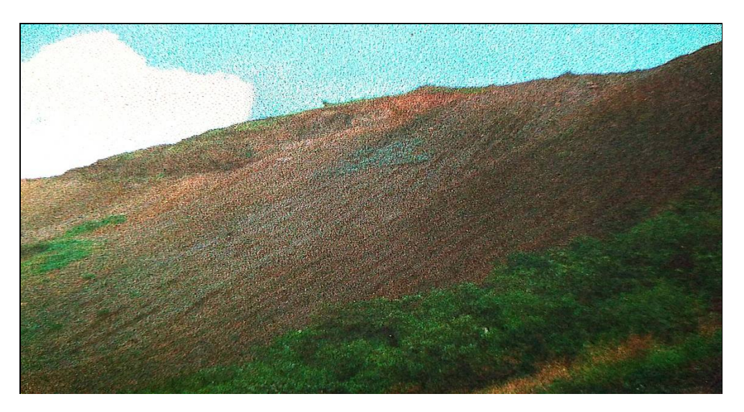
Fig. 2B Iron Ore Fines stacking at foot hill near N E B Range

Fig. 2ALow Grade Iron Ore dumps in Ramanadurga Range