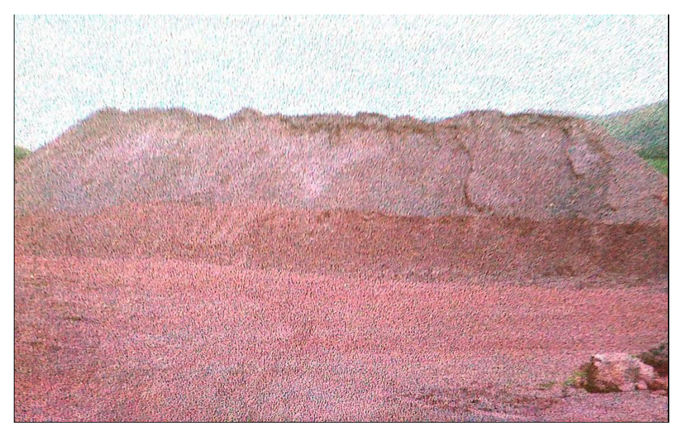
Table .1Location and Chemical analysis details of stream sediments.