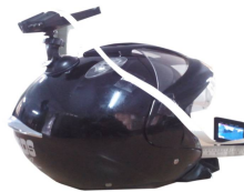
Fig. 4.2 shows the fabricated model of intelligent helmet

The figure 4.1 shows the block diagram which includes Helmet, Camera, Control Unit, LCD screen, Power Supply, Storage and Interfacing Module.