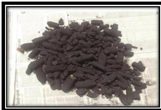
Figure 5: corn-cobs charcoal