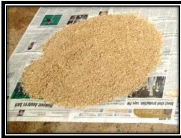
Figure 4: Powdered form of corn-cob