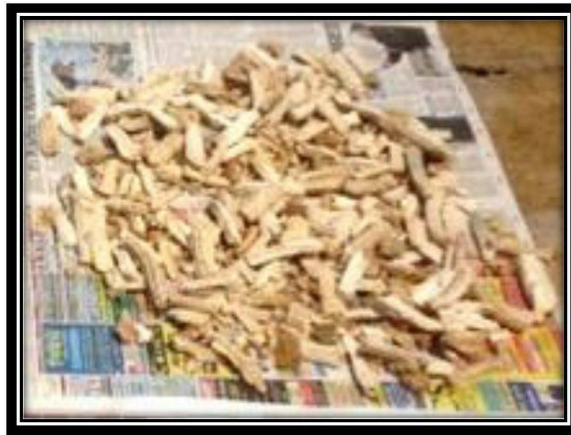
Figure 1: Corn cobs