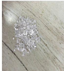
Figure 1 – Polythene Strips

Polythene was collected and cutted into small strips, Polyethylene absorbs almost no water. The gas and water vapor permeability (only polar gases) is lower than for most plastics; carbons, oxygens. PE can become brittle when exposed to sunlight, carbon black is usually used as a UV stabilizer. Polyethylene is a good electrical insulator. It offers good tracking resistance; however, it becomes easily electrostatically charged (which can be reduced by additions of graphite, carbon black or antistatic agents) Polyethylene is of low strength, hardness and rigidity, but has a high ductility and impact strength as well as low friction. It shows strong creep under persistent force, which can be reduced by addition of short fibers. It feels waxy when touched.