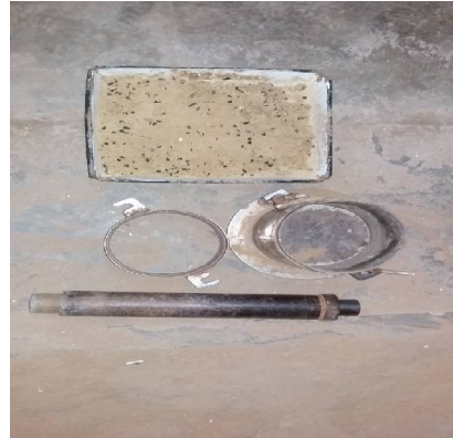
Figure 2 – CBR Test Mould