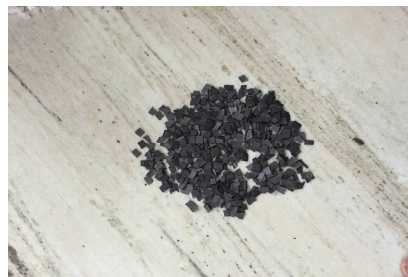
Figure 1 – Rubber Tyre Chips

Shredded rubber tyre was cut into different sizes ranges from 1mm to 25mm (Width) and 3mm to 50mm (Length). Added amount of rubber tyre had been varied in proportions of 4%, 5%, 8% and 10%.