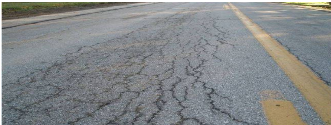
Fig.3. Alligator Cracking

Fatigue cracking is also known as alligator cracking or crocodile cracking, which is common type of distress in asphalt.