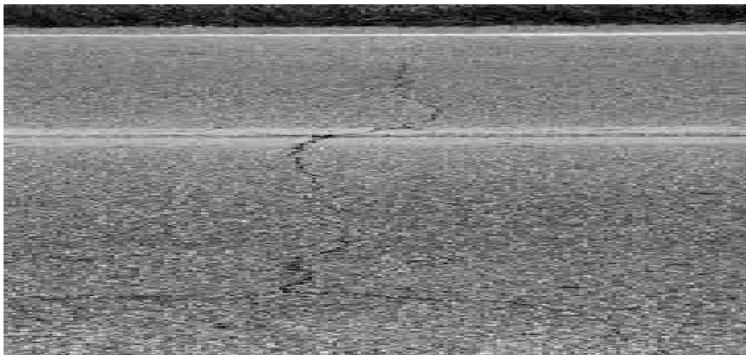
Fig.2. Transverse cracking

Transverse cracks are cracks that are perpendicular to the roadway alignment. This is generally due to the temperature changes with shrinkage during the curing which causes tension in the concrete and concrete will expand and contract with temperature.