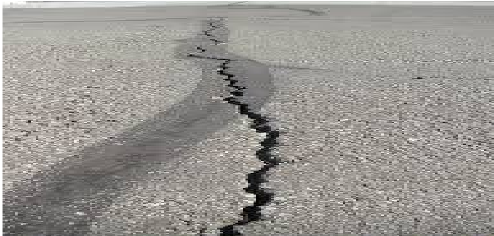
Fig.1. Reflective cracking

The road surface initiated cracks generally the result of cyclic result of temperature. In thick asphalt pavements, these cyclic, diurnal and annual changes are primarily responsible for crack development. The temperature of the asphalt in summer exceed up to 50 degree C. The road temperature is normally 35 higher than the atmospheric temperature, This types of cracking is very dangerous for people and excessive loss of texture depth and rutting may affect vehicle steering and braking.