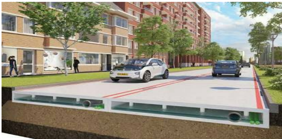
Fig.5 pipe system beneath the road

from drainage and collect into the filtration chmber where the filthy watre get filterd and filter or clean water goes to main chamber and circulate by the main pipe which spray the water and this proces repeat agin when the ssysytem need to clean the pavment.