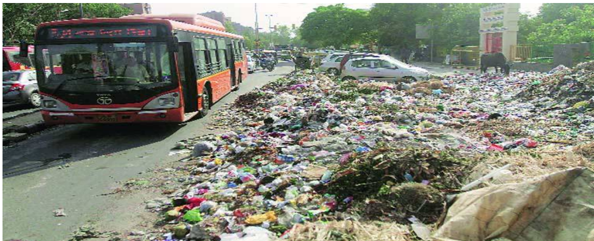
Fig.4 Waste spread on road