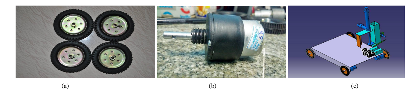
Fig. 2 Components of Automated Transplanter (a) Rubber Wheels (b) DC Motor (c) Design and Modelling

Fig.1 Components of Automated Transplanter (a) Air Compressor (b) Base plate (c) Pneumatic Cylinder (d) DTDP Switch (e) 5/2 Solenoid Valve