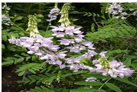
Galega officinalis is a natural source of galegine.

The biguanide class of antidiabetic medications, which also includes the withdrawn agents phenformin and buformin, originates from the plant Goat's rue ( Galega officinalis ) also known as Galega, French lilac, Italian fitch, Spanish sainfoin, Pestilenzkraut, or Professor-weed. (The plant should not be confused with plants in the genus Tephrosia which are highly toxic and sometimes also called Goat's rue.) Galega officinalis has been used in folk medicine for several centuries. [149] G. officinalis itself does not contain biguanide medications which are chemically synthesized compounds composed of two guanidine molecules and designed to be less toxic than the plant-derived parent compounds guanidine and galegine (isoamylene guanidine). [149]