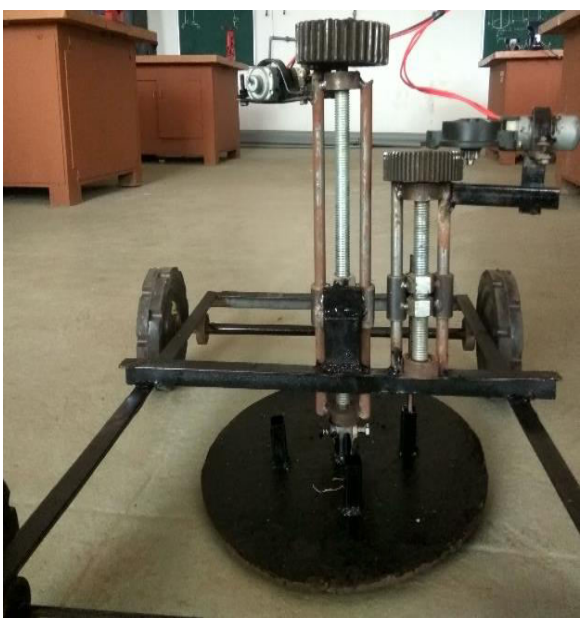
fig 1 Image of set up

The image of the prototype system is shown in the fig 1. It consists of a lifting plate, lead screw, spur gear, 2 dc motor. The dc motor isoperated by 12v 7A rechargeable battery. The frame is made of mild steel . There are some slot is attached concentrically on the lifting plate.