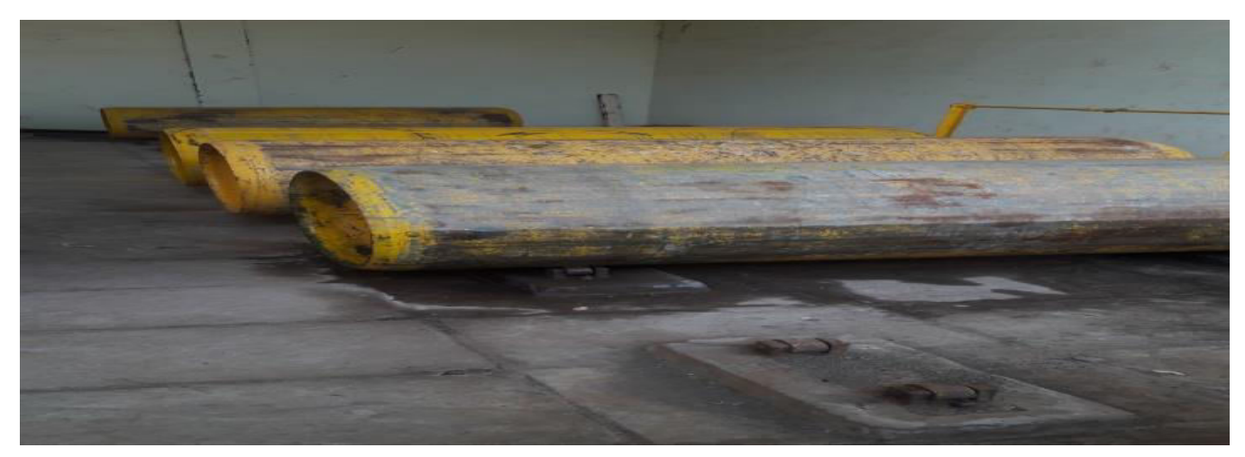
Figure 4 Chlorine Cylinder Use for Disinfection Process. V. DESIGN RESULTS

Filtration Unit: During this process the water enters through upper valve, moves down towards the filter bed, after passi ng through filter bed and underdrainage system it flows out through lower valve. The unit used to measure the filtration rate is inflow rate (m^3/hr) divided by filtration area (m^2) .