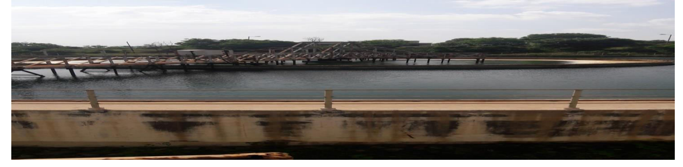
Figure 3 Sedimentation Tank

Clariflocculator Unit: This is the third treatment process. In this process as the water contains negatively charged particl es whose amount of charge is been calculated and same amount of positively charged particles are added to water whic h results in the formation of large molecules of positive and negative charge particles due to process of attraction and th is particles then settled down in sedimentation zone under the action of gravity. From these zones these particles are eas ily removed.