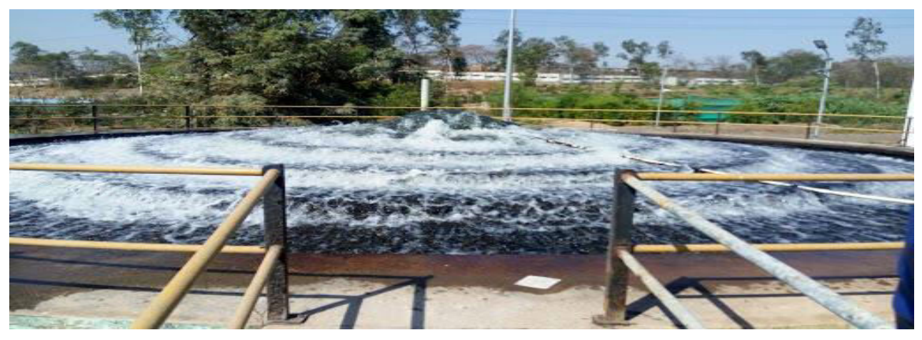
Figure 2 Cascade Aerator

Aeration Unit: After the laboratory test is being conducted the water is send to the aeration unit where the oxygen level of the water is been increased and the other gases are emitted out in the atmosphere. The Cascade type aerator is used in most of the water treatment plant and even in Jalgaon Water Treatment plant.