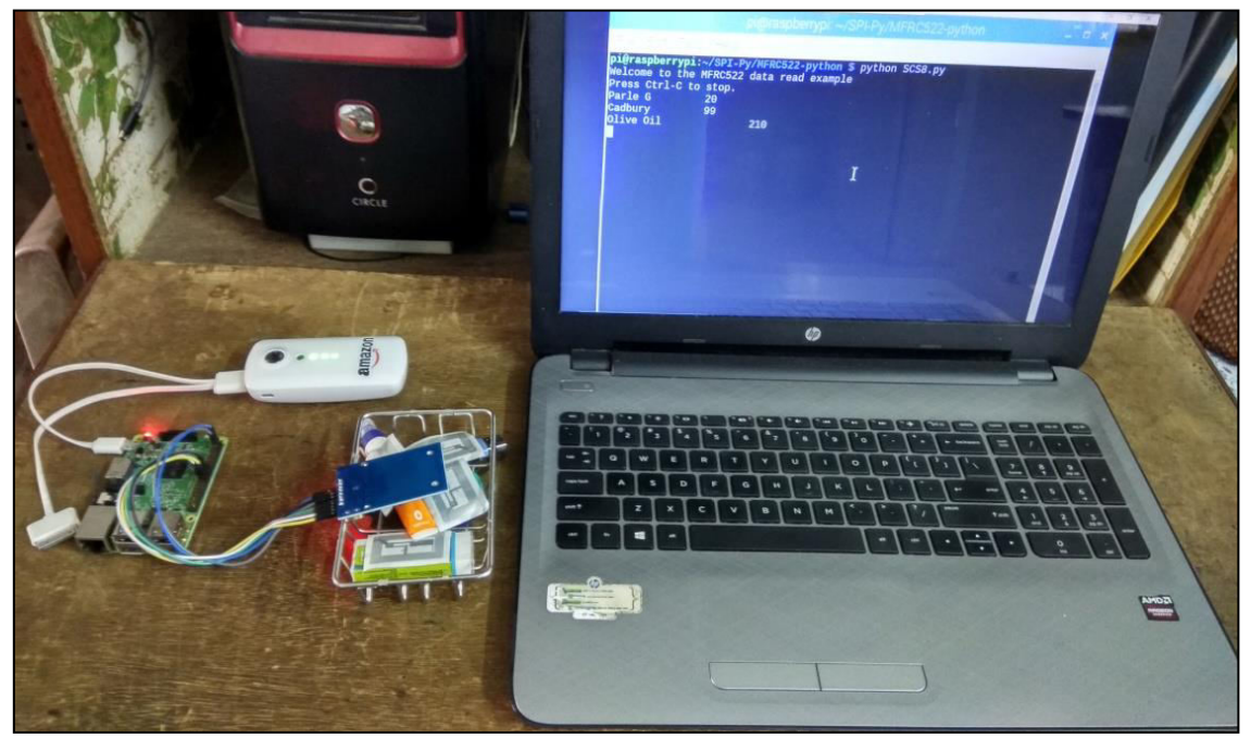
Figure 2: Connection of devices and working of reader to identify the products

(A High Impact Factor, Monthly, Peer Reviewed Journal) Visit: <u>www.ijirset.com</u> Vol. 7, Issue 4, April 2018