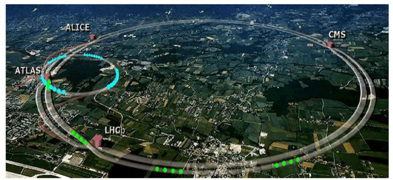
Figure 2: Cern Hadron Collider: From Popsci (Great Dreams, 2010).

(A High Impact Factor, Monthly, Peer Reviewed Journal) Visit: <u>www.ijirset.com</u> Vol. 7, Issue 4, April 2018