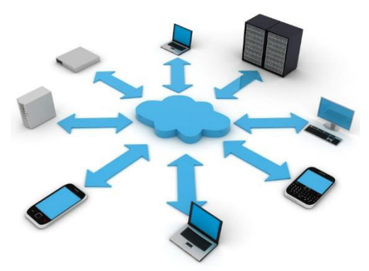
Figure 1. Cloud Computing

There are limitation in the current cloud computing model prevent direct collaboration among applications hosted by different clouds. A way that could remove these restrictions uses of proxies. A proxy is an edge-node-hosted software instance that a user or CSP can delegate to carry out operations on its behalf. Proxies can act as mediators for collaboration among services on different clouds. As an example of proxy-facilitated collaboration between clouds, consider a case in which a user or CSP wishes to simultaneously use a collection of services from different clouds. First, the requesting entity chooses proxies to act on its behalf and to interact with cloud applications. A user or CSP might employ multiple proxies to interact with multiple CSP.