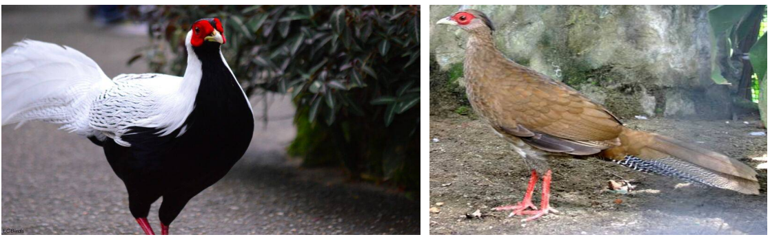
Male Silver Pheasant (Lophura-nycthemera)

Pheasants belong to a family 'Phasianidae', order 'Galliformes' that includes some of the most beautiful birds in the world such as the Golden pheasant, famous in Chinese art, have delighted and benefited man for centuries but sadly many of them are today under threat as a result of his activities. There are forty-eight different species of pheasants, according to the IUCN. Red list of Threatened spp. Behaviour of silver pheasant is largely directed towards self and racial-survival. It is an internally directed system of activities, which strives to maintain the physiological stability of the body in the face of many environmental hazards, such as heat & cold, sun and rain, lack of food, competition, predators and parasites. It is also a system that, through reproductive behaviour, tends to guarantee the continuation of the species. Behaviour is influenced by many factors such as harmones, nutritions, periodic physiological cycles, age and maturation and particularly the past experiences of the individual year.