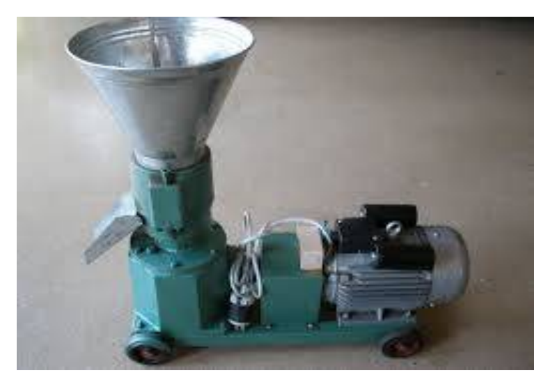
Fig 2: Dusting Equipment

The solar plate trappers, traps the solar energy and the power is stored in the battery. This power is used to drive the system. The switch is on and the power is given to drive system which operates the rotary fan. The powder to be spray falls down in front of the rotary fan by mean of air pressure the powder is forced out of the pipe. The adjusting rod is used to adjust the powder falling from the powder container according to requirement.