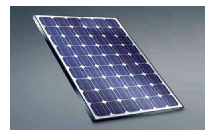
Fig 4: Solar Panel

A solar panel (also solar module, photovoltaic module or photovoltaic panel) is a packaged, connected assembly of photovoltaic cells. The solar panel can be used as a component of a larger photovoltaic system to generate and supply electricity in commercial and residential applications. Each panel is rated by its DC output power under standard test conditions, and typically ranges from 100 to 320 watts. The efficiency of a panel determines the area of a panel given the same rated output - an 8% efficient 230 watt panel will have twice the area of a 16% efficient 230 watt panel. Because a single solar panel can produce only a limited amount of power, most installations contain multiple panels. A photovoltaic system typically includes an array of solar panels, an inverter, and sometimes a battery and or solar tracker and interconnection wiring.