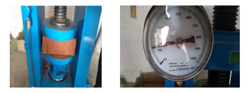
Fig B-1.2 compression strength test on conventional bricks

Fig B-1.1 compression strength test on plastic bricks, interlocking bricks & paver block.