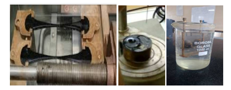
Fig A- 2.1 Testing on bitumen (Ductility, penetration & softening point).