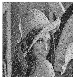
b)10% corrupted image by ASMROMF