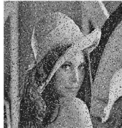
d)10% corrupted image by ASMROMF