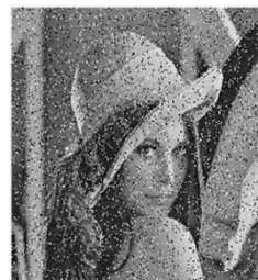
f) 10% corrupted image by ASBSROMF