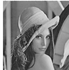
e)Filtered by ASMROMF of (d)