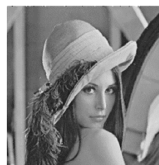
g)Filtered by ASBSROMF of (f)