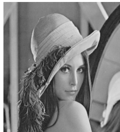
a) Original Image