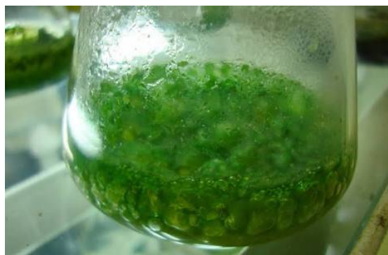
BLUE GREEN ALGAE

the host plant. Bio-fertilizers add nutrients through the natural processes of nitrogen fixation, solubilising phosphorus. Hence do not contain any chemicals which are harmful to the living soil.