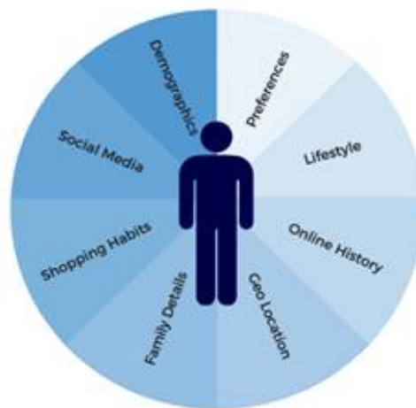
Fig 3.1: Customer Data

knows the shopping histories, habits, and preferences of their customers and can create marketing campaigns at almost the individual level.