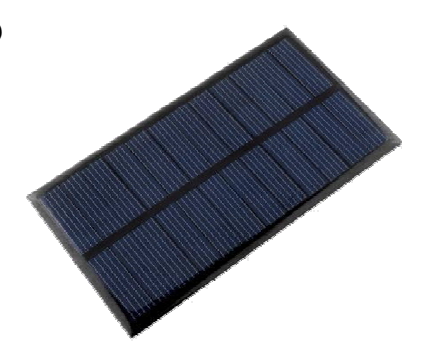
Figure 1 Solar Panel

Output Current – 500 mA Dimensions – 136 x 72 x 2 (in mm)