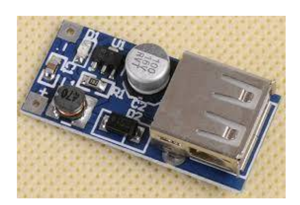
Figure 2 dc to dc Convertor Amplifier

An Integrated Back Cover: - Mobile Back Cover is used to support solar panel and also give protection to the sides and edges of mobile phone. They are basically used to provide safety to the mobile phones.