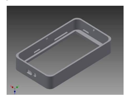
Figure 3 CAD Model of Back Cover

Length = 140 mm, Width = 74mm, Height = 10mm, sheet thickness = 1mm, Chamfer on edges = 1mm