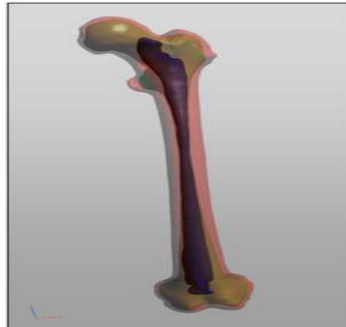
Fig.1 A Segmented image of Femur Bone

Performance analysis plays a vital role since segmentation algorithms often have limited accuracy and precision. Interactive drawing of the desired segmentation by human raters has always been an acceptable approach, and yet suffers from intra-rater and inter-rater variability. Automated algorithms have been sought in order to remove the variability introduced by raters, but such algorithms must be assessed to check their endurance whether they are suitable for the task or not. The performance of raters (human or algorithmic) generating segmentations of network or individual battery energy of a node [1]. Medical images has been difficult to quantify because of the difficulty of obtaining or estimating a known true segmentation for clinical data. An example of segmented image is shown in Fig.1