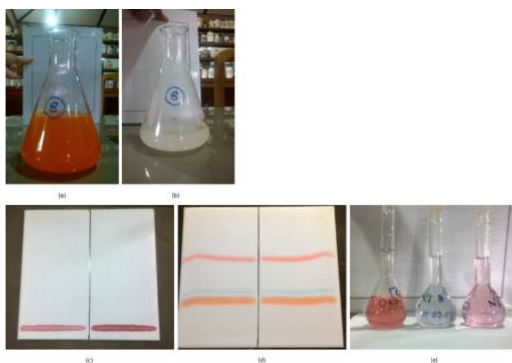
Figure 3: (a) Carbonated drink before extraction of food colourants (b) Carbonated drink after the extraction of food colourants (c) Extracted colourants spotted on the preparative TLC place (d) Developed preparative TLC plate (e) Solutions of separated colourants

The results of the analysis of 5 types of carbonated drinks can be summarized as given in the Figure 2. As every country Sri Lanka has a set of permitted food colourants according to the Food (Colouring Substances) Regulations – 2006 and its amendments. According to this regulation, the maximum permissible level of artificial food colourants that can be included in a particular type of food or drink is 100 ppm. Therefore, it can be concluded that all other 4 types of carbonated drinks except the carbonated drink C did not exceed the maximum permissible level.