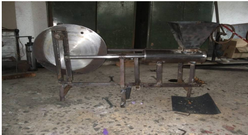
Figure 2: Actual photograph of the set up