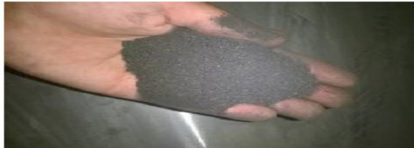
FIG1. WASTE FOUNDRY SAND