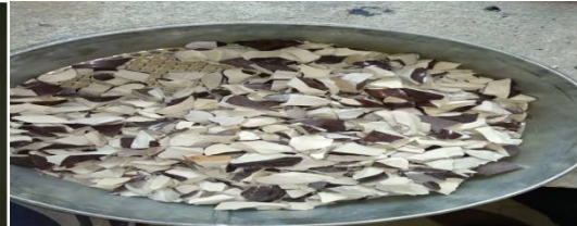
FIG. 2 WASTE CERAMIC TILES

A ceramic material is an inorganic, non-metallic, often crystalline oxide, nitride or carbide material. Some elements, such as carbon or silicon, may be considered ceramics. Ceramic materials are brittle, hard, and strong in compression. Ceramic tile aggregates are hard having considerable value of specific gravity, rough surface on one side and smooth on other side, having less thickness and are lighter in weight than normal stone aggregates. Using ceramic tile aggregate in concrete not only it will be cost effective, but also provide considerable strength to the concrete. In the present study, effect of foundry sand as fine aggregate replacement and waste ceramic tile as coarse aggregate replacement on the compressive strength, split tensile strength and modulus of elasticity of concrete having mix proportions of M 40 grade was investigated. Fine and coarse aggregates were replaced with three percentages of foundry sand. The percentages of replacements were 0, 10, 20, and 30 % by weight of fine aggregate. Tests were performed for compressive strength, for all replacement levels of foundry sand at different curing periods (7&28-days). Test results showed that there is some increase in compressive strength, after replacing the fine aggregates with certain percentage of foundry sand so foundry sand can be safely used in concrete for durability and strength purposes.