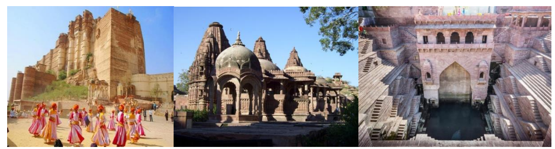
Figure 2. Cultural dance ,Siddhanath Shiv Temple, Jodhpur, Toorji ka Jhalra in Jodhpur