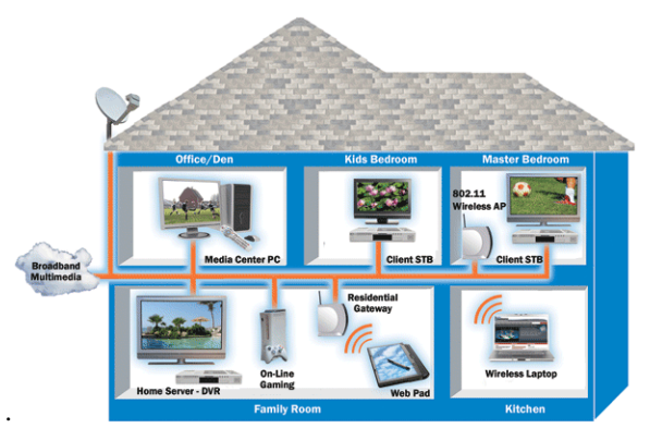
(a) Structure of Networking between the different computers