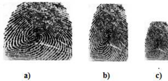
Fig. 3. Preprocessing Step a) Input Fingerprint image b) Enhanced Image after applying CLAHE, c) Image resized by 164*164