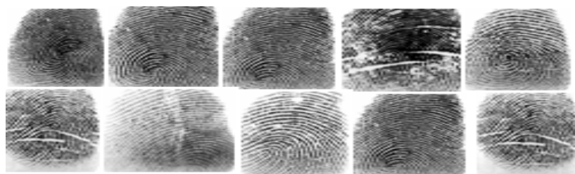
Fig. 2. Sample of fingerprints

As there is no separate standard dataset for male and female fingerprints, a dataset of fingerprints of different age group were collected from rural and urban areas. Hence experiment was conducted using our own dataset. The main purpose for the creation of database is to check the robustness in the gender identification. Database contains of totally 74 healthy persons fingerprints, of which 37 are male volunteers and 37 female volunteers. Each individuals ten fingers print images are collected giving them a prior directions. Thus totally we have 740 fingerprints images, which are further been considered for the experiment. Sample from our database are shown below in figure 2.