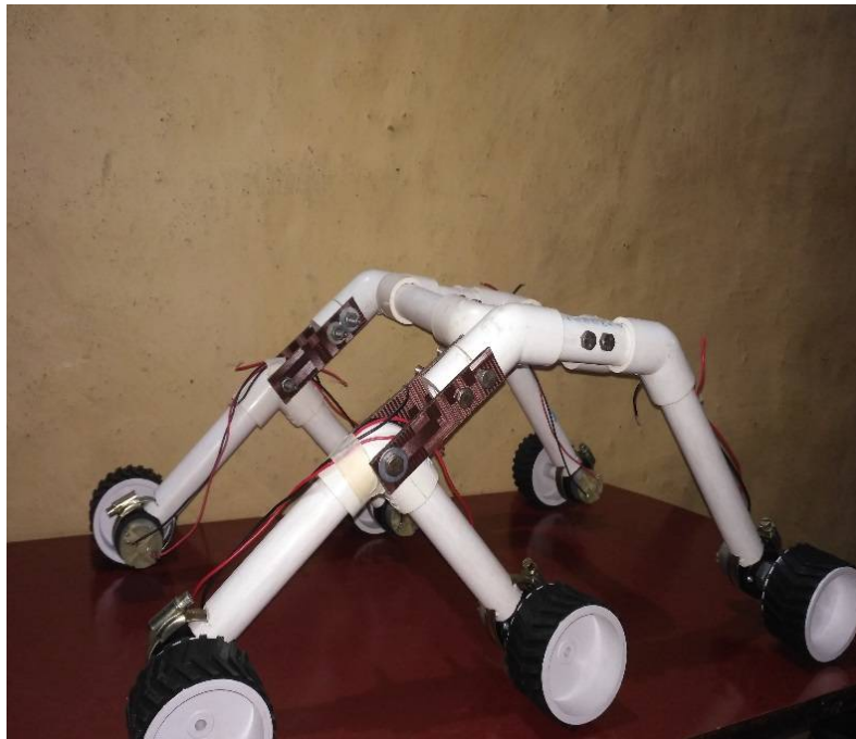
Fig.5 Side view