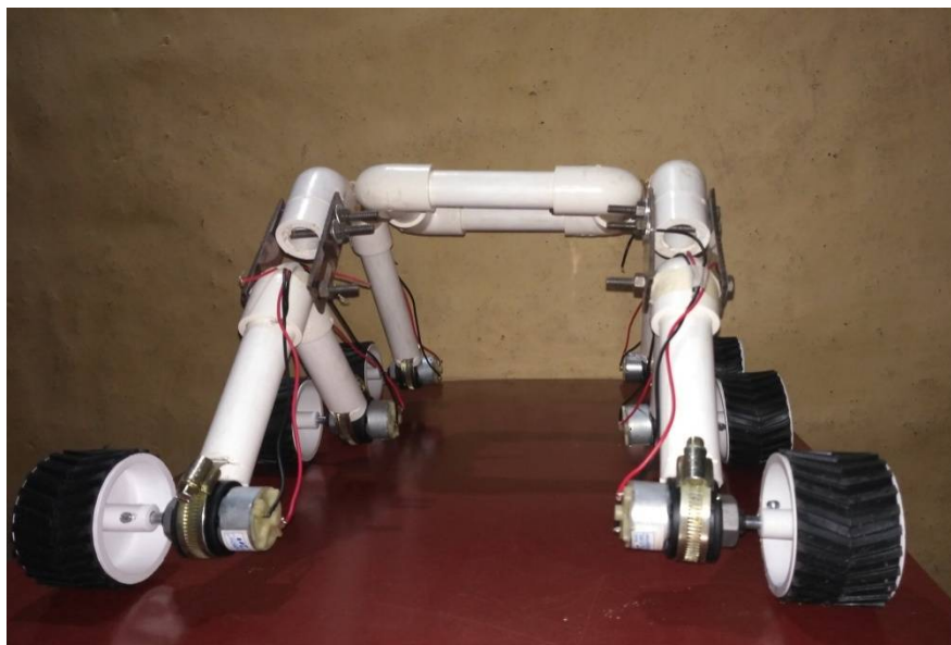
Fig.4 Front view OF rocker bogie mechanism