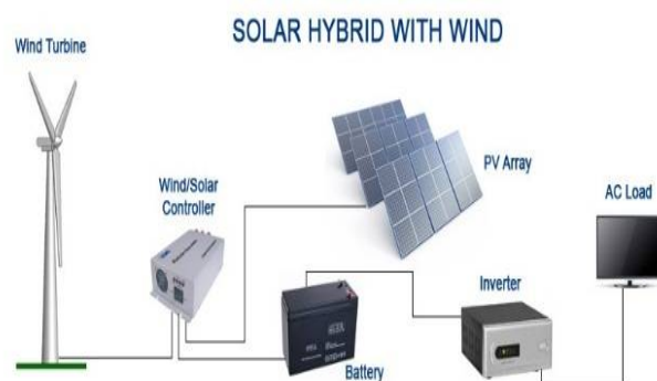
Fig: Working Of Wind And Solar Hybrid System

If the solar energy is having maximum power then the solar is get directly connected to the load .And if the wind energy is more then it get directly connected to load. And when solar and wind energy is combine then same amount of the supply comes in circuit then solar is used to store the charge in battery and wind is directly connected to the load or vice-versa. Generally electricity into battery bank with help of solar charge controller and wind controller. The DC load is stored in battery and it will convert the AC load with help of inverter