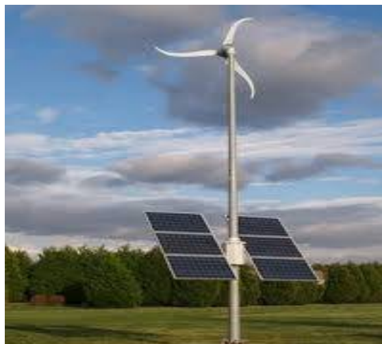
Fig : wind turbine

Wind turbine is used to convert the mechanical energy into electrical energy. It produces kinetic energy through the rotation of the turbine. These are installed on the top of the tower and convert it into electrical energy. This turbine is manufactured on the basis of vertical and horizontal axis. This is now an important growing source of intermittent renewable energy. In addition, the generation of electricity using wind turbines is well suited for isolated places with no connections to the outside grid [7]. When the output power of the fan is too large, if you still need to charge the battery, then part of the power must be removed through uninstalling the circuit in order to avoid damage of generation system [9].