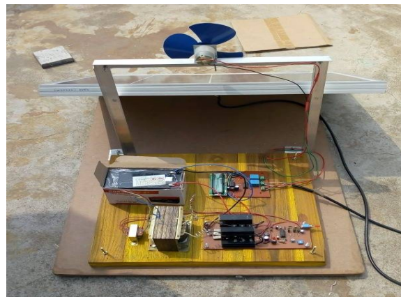
Fig: Represented the solar and wind hybrid system