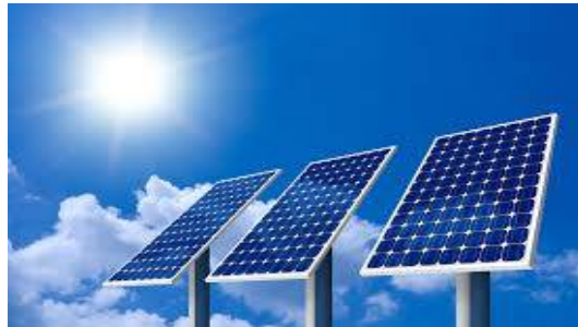
Fig: Solar panels

The number of PV panel is connected in series and also we connect it in parallel the output will be DC out of the incidence irradiance. Orientation and tilt the panels most important part in designing parameter