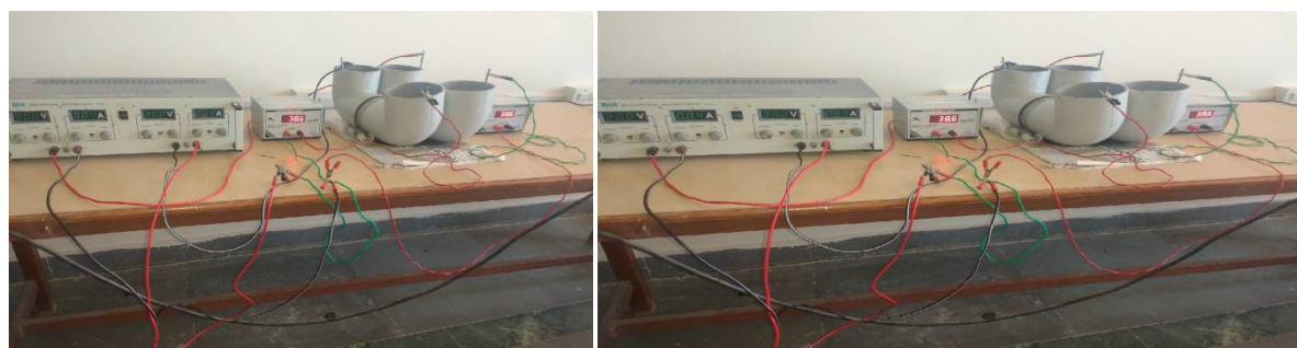
Fig. 1. Experimental setup