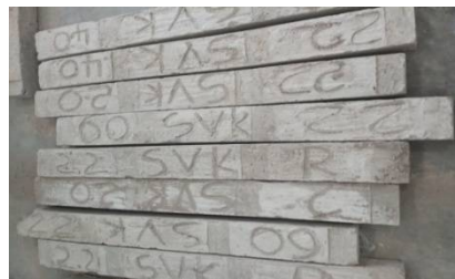
FIG:3 casting specimen

Fig.2. Preparation of specimen after mixing of the concrete and filled the mould