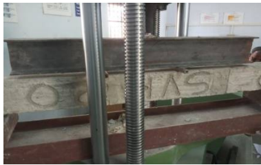
FIG:4 testing of specimen

Fig. 4 .after curing the specimen ready to test