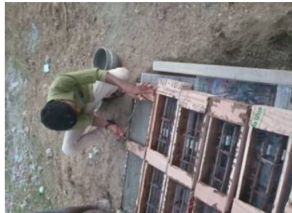
FIG:2 casting of the beam

Fig.2. Preparation of specimen after mixing of the concrete and filled the mould