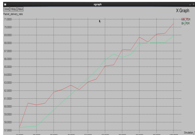
Fig.5 Packet Delivery Ratio Analysis