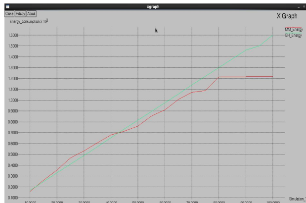
Fig.2 Energy Consumption Ratio

The following figure illustrates the energy consumption ratio of the proposed work. Obtain the performance of Bellhop, Monterrey Miami Parabolic Equation (MMPE), propagation model in the terms of energy with respect to time. Comparison of energy consumed between BH, MMPE, performance is analysed. X-axis represents simulation time in secs and Y-axis represents energy in joules. Energy consumption is less in MMPE propagation model when compare to other propagation models.