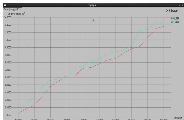
Fig.4 Bit Error Rate

The following figure illustrates the BER of the proposed work. Obtain the performance of Bellhop, Monterrey Miami Parabolic Equation (MMPE) propagation model in the terms of energy with respect to time. Comparison of energy consumed between BH, MMPE performance is analysed. X-axis represents simulation time in secs and Y-axis represents energy in joules. Energy consumption is less in MMPE propagation model when compare to other propagation models.