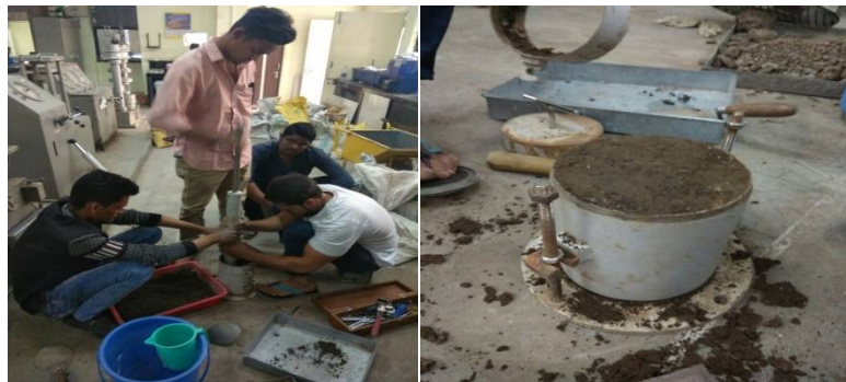
Figure 2 CBR Test

The above photograph shows the CBR testing of material for the project.