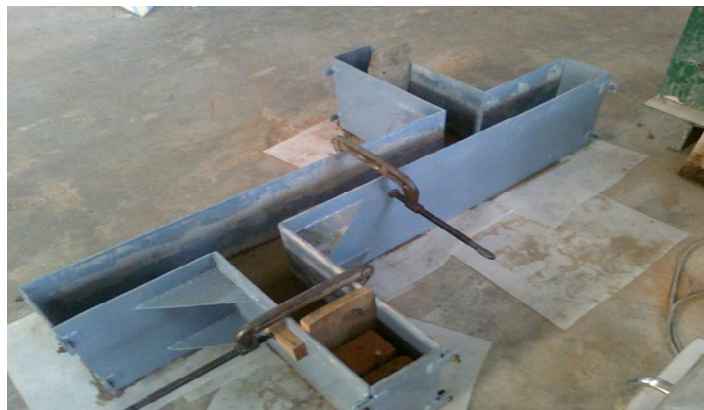
Img: Steel frame used for casting beam