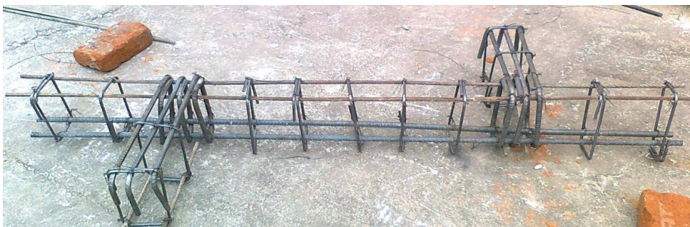
img: Reinforcement cage